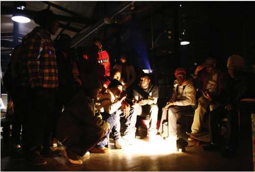
Emcees around the fire...love...sharing the light...

Detroit held it down on its end, with most of their dopest lyricists being female – a feat which could well deliver hip-hop from the doldrums; a sense of being in tune with the genteel. Branding for Stokvel # 2 was swiftly put together by three suspects; Mmataseleng, Dala & Small who all are from different collectives but fighting for one root cause. The brand was rapidly hand-printed on numerous surfaces, such as fabric that acted as a banner dropped vertically outside the balcony of the Point Blank Gallery. Other branded surfaces included street poles, which were branded with red chart paper with the Stokvel # 2 ID going right around the poles acting as a guide route to the Drill Hall from Newtown. The rest of the surfaces were strategically and randomly printed within the Point Blank Gallery space itself.