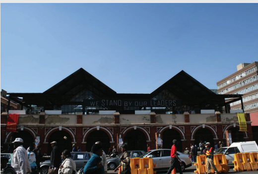
We didn't invent this s**t...we simply innovate