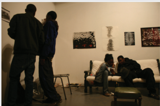
In-house guerrilla tactics