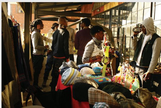
Hlubi representing Eskodini to Man Purple...

were luminaries such as Last Days Fam, Sub-stance, Projectah and Quaz all of whom ripped to shreds on the mic.