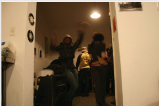
Nostalgia is the neo-pop