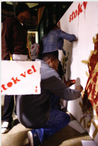
What is Stokvel?

While still on the heavy part, it would have been of good use if we had a printout of the programme or an ongoing in-house radio in between the DJ sets to keep people updated. For example, how many of those of y'all who made it know that up to 17 FRESH tracks were laid down? That's madness right? Much love and respect to Slang Entertainment and Pullover Records. That the quality is dope is magical in a space where people were laughing and dancing and talking and stuff. Look out for Stokvel mixtape!!! Most aspects of Stokvel #2 meant that people were participants rather than audience, for example the huge canvas kept people busy painting and visualising thoughts live in the space.