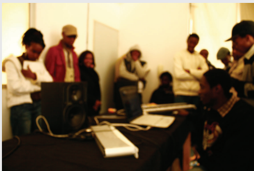
Studio kinda cloudy...