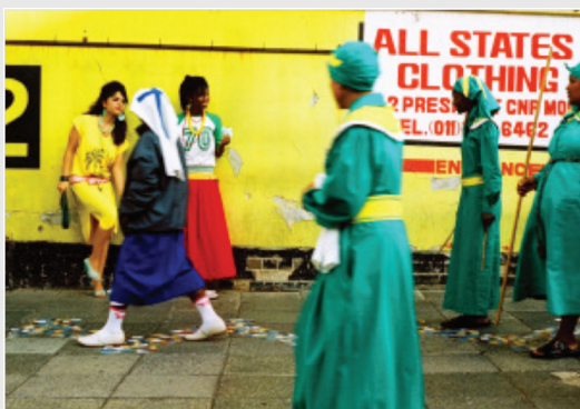
Nhlanhla Mngadi, Hawkers Welcome , 2004, FibaPrint on cotton paper, 5/10