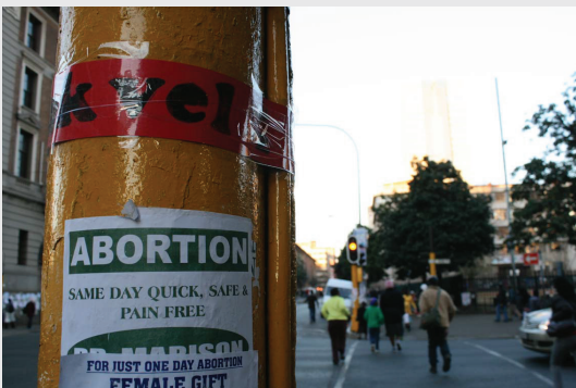
very common, no?